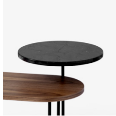
Nero Marquina marble, lacquered walnut & brass