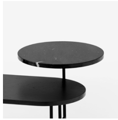
Nero Marquina marble, black lacquered ash & brass