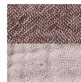
→ Cloud & Burgundy