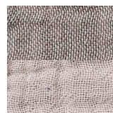
→ Cloud & Slate