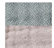
→ Cloud & Sage