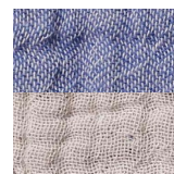
→ Cloud & Blue