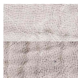
→ Cloud & Milk