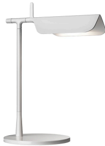
Table lamp. Body in painted pressofused aluminium. Multi-led diffuser in specially designed PMMA to avoid the Multi Shadow effect and dazzle. Head rotation \pm 45^\circ .